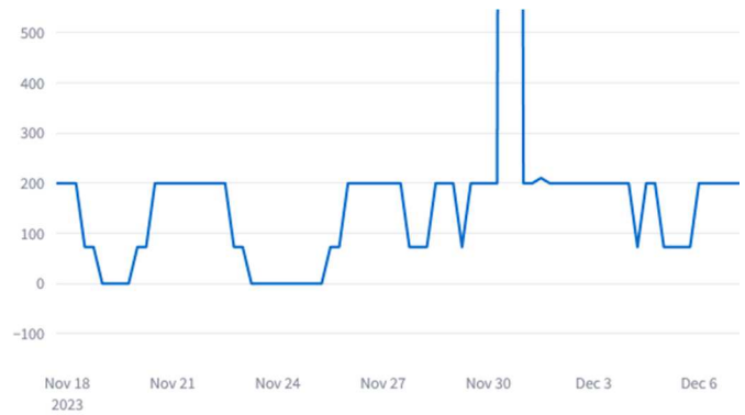
Figure 2: Electricity prices in EUR/MWh, emission limit 50 Mt

Reducing the emission limit from 200 million tons to zero, fossil technologies are excluded from the energy mix. In this zero-emission scenario, there is a strong increase in investments in renewable energy technologies, along with the deployment of hydrogen power plants, storage capacities, and electrolyzers. This transition results in a markedly different residual load duration curve, which falls into negative after less hours of the year. Storage systems and electrolyzers are crucial in managing this shift, creating a “gap” between negative residual load and the total curtailment of renewable energy generation, see the right part of Figure 3. The total system costs rise from €30.19 bn. in the standard scenario to €50.86 bn. in the zero-emission scenario, highlighting the additional investments required to achieve a fully decarbonized energy system. These changes underline the economic and operational challenges of transitioning to a zero-emission power sector.